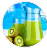
Kiwi Fruit Juice